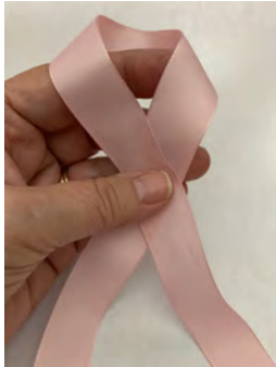
Step 1 Left over right.

The flower petals are made with a single "U" stitched ruffled petal. Cut the length of the ribbon 2 to 2-1/2 times the width of the ribbon plus 1/2". The instructions for this technique are in Jan's book, The Art of Elegant Hand Embroidery, Embellishment & Applique , page 146.