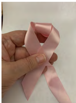
Step 4 Right over left.